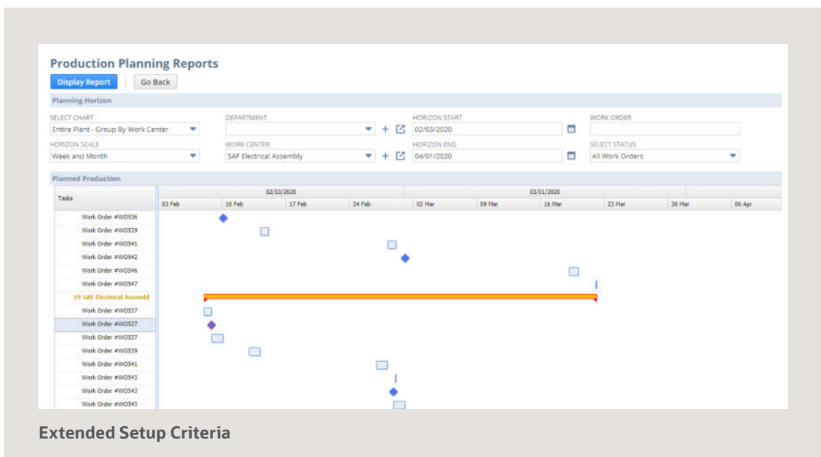
Extended Setup Criteria

You can seamlessly upgrade from one edition to another.